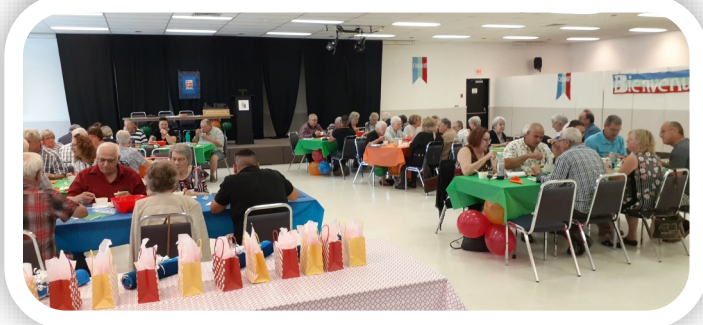
See on your left, three pictures of the participants of the 15th anniversary of the association in the Léandre Boutin room.