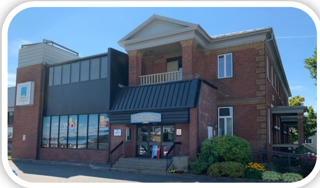
Cap-Saint-Ignace cultural center where Léandre Boutin's room is located