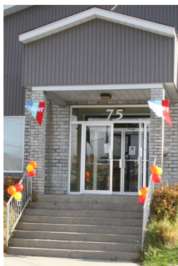
Municipal Hall Guy-Veilleux