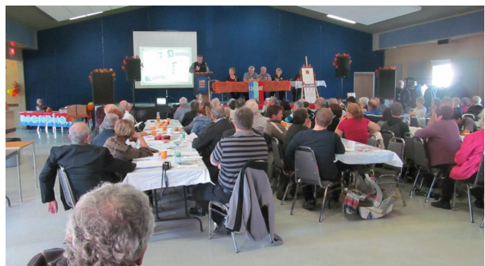
Two pictures of our members at the brunch