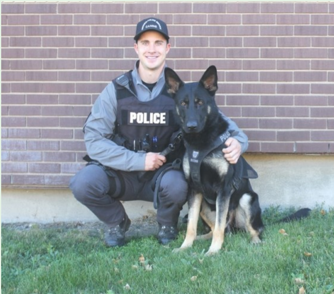
The Estevan Police Service's K9 officer and his police dog