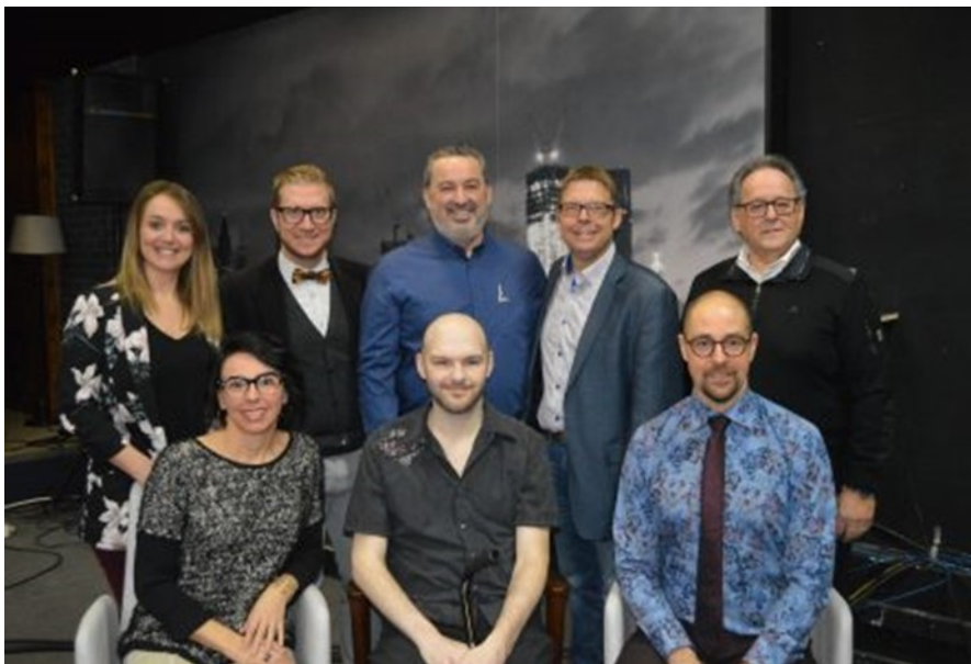
With members of the board of directors